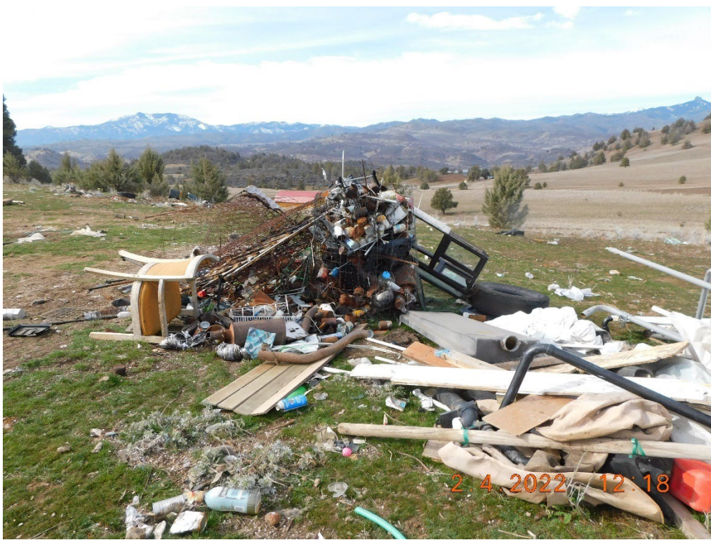
Figure 6: Facing Northeast