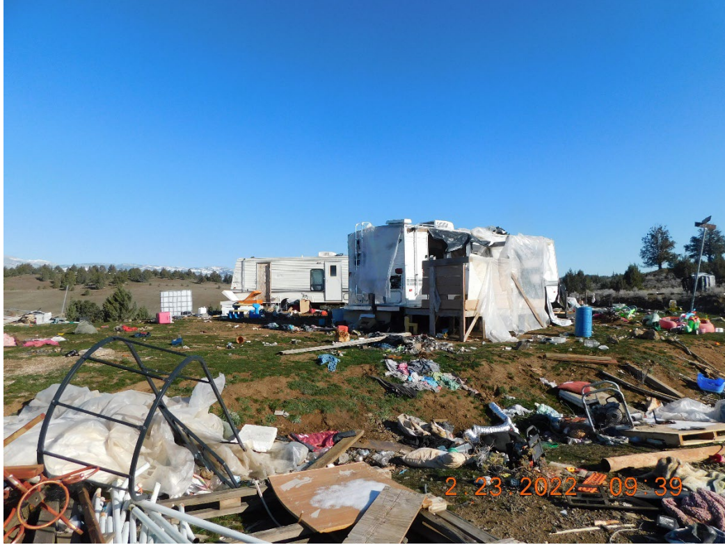
Figure 4: Facing North