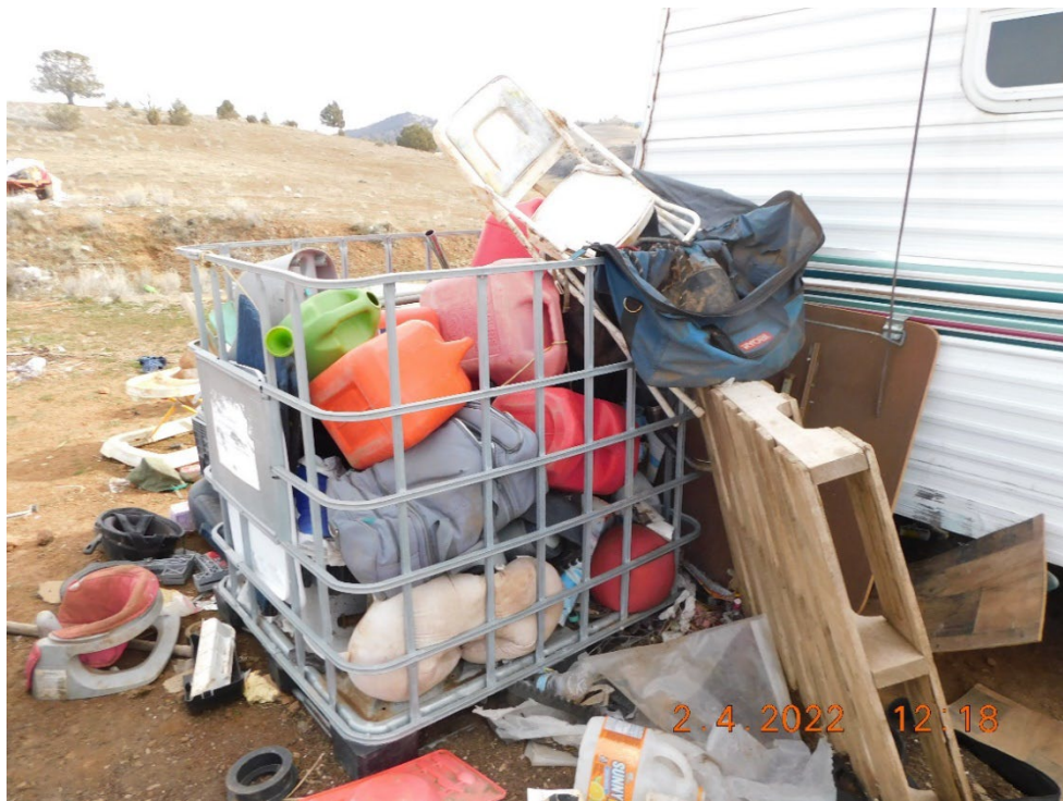
Figure 5: Facing Northwest