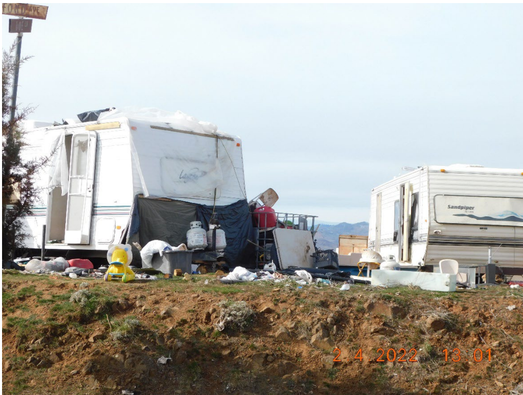
Figure 7: Facing North