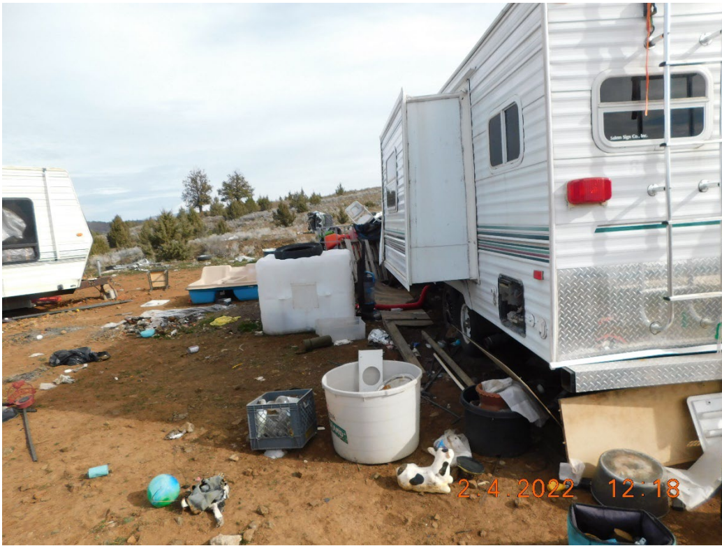
Figure 3: Facing East