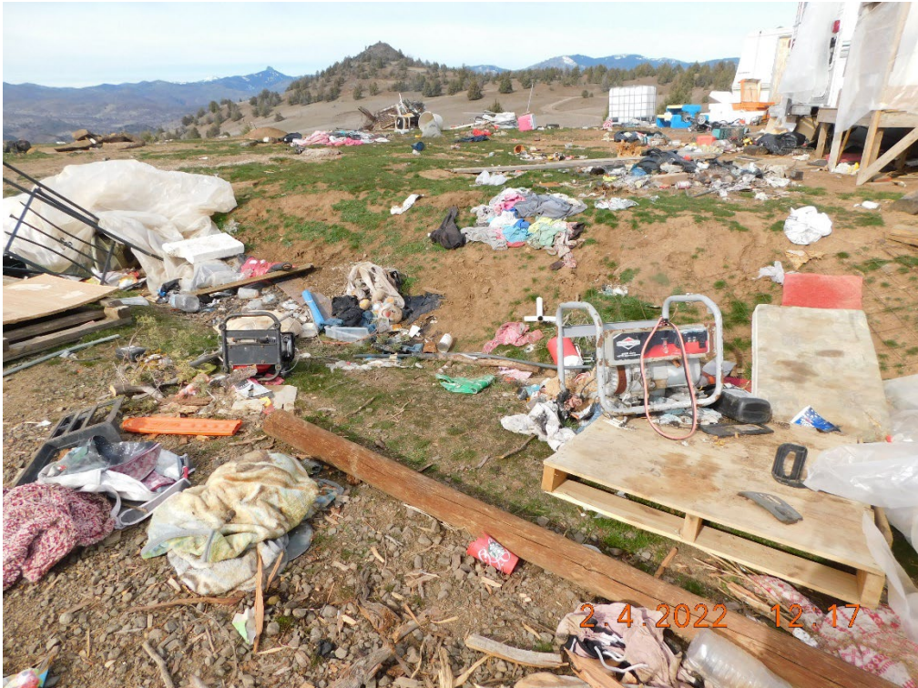
Figure 2: Facing North