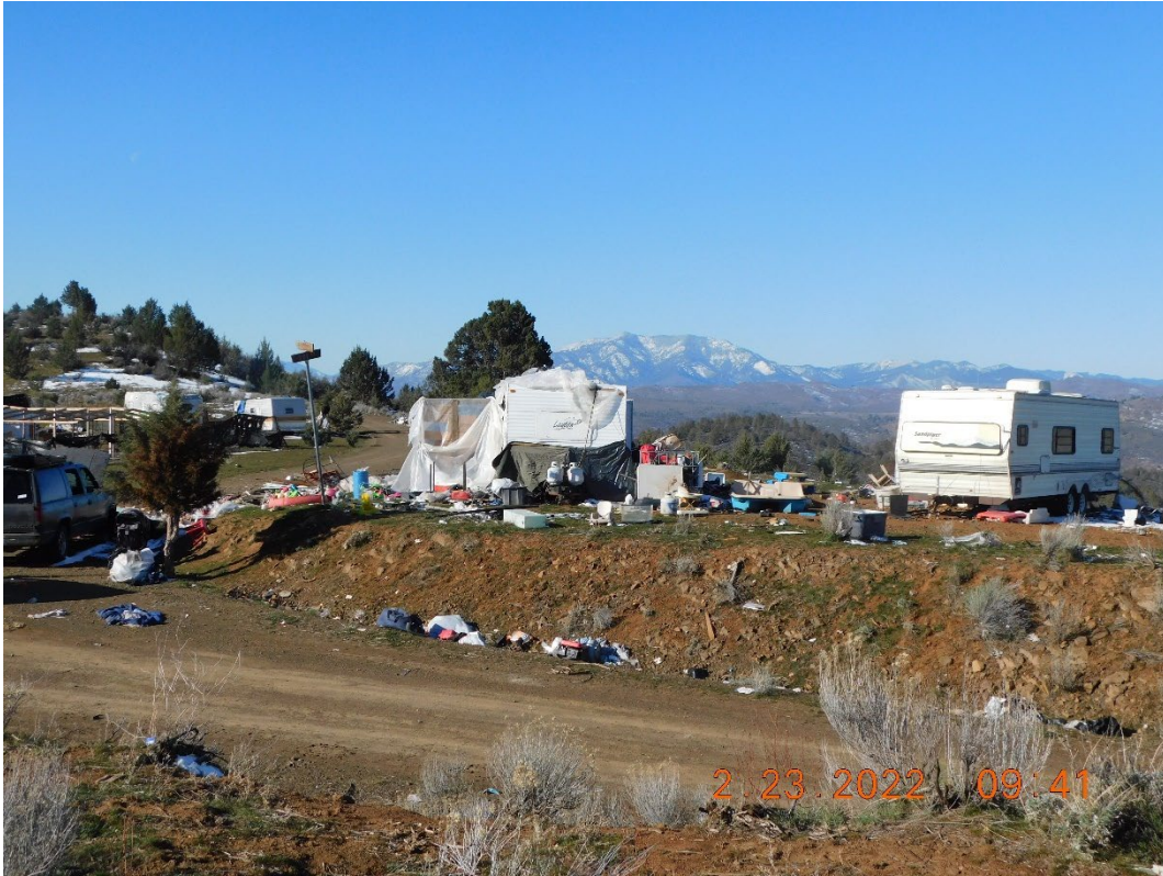
Figure 8: Facing West from Doe Avenue